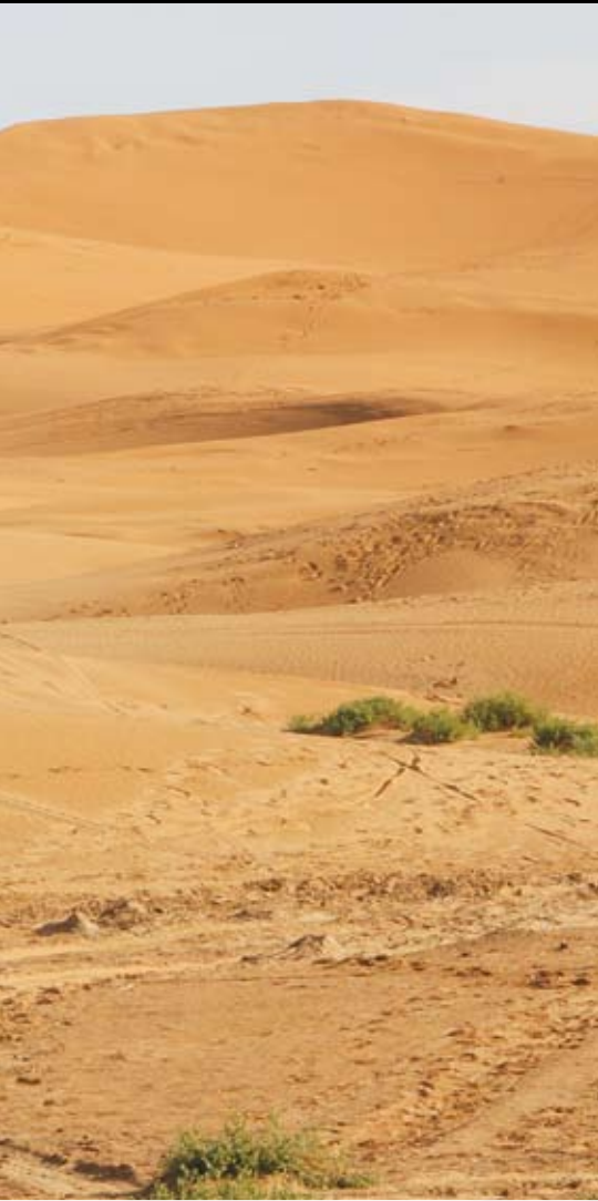
The Discovery 2 makes light work of the Moroccan roads