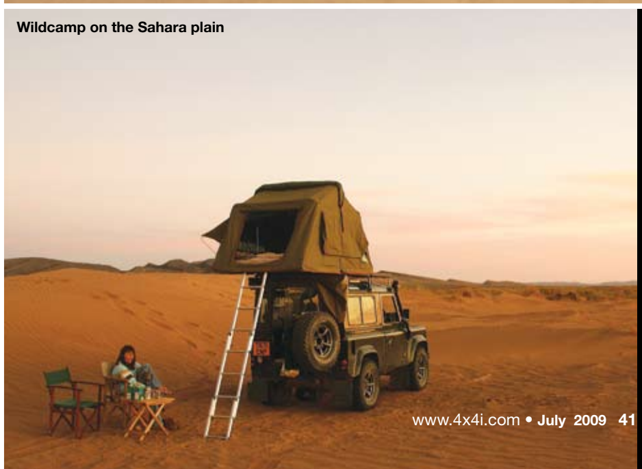
Wildcamp on the Sahara plain