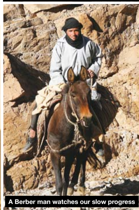
A Berber man watches our slow progress

Sharon, my travelling companion, and I looked like we had crawled from under a dusty rock, so we were glad to hear that night's official campsite had the option of roof tenting or a small clean bungalow with hot showers. We left the campsite the following day clean and promptly, as we had a long day ahead. Heading south once again, our destination was Midelt. Before we left town the trucks were checked over and fuelled up. Climbing for a few hours up a dusty trail we made our way across the middle Atlas, reaching 2000 metres of altitude. We drove down endless ribbons of straight black top with a huge blue sky