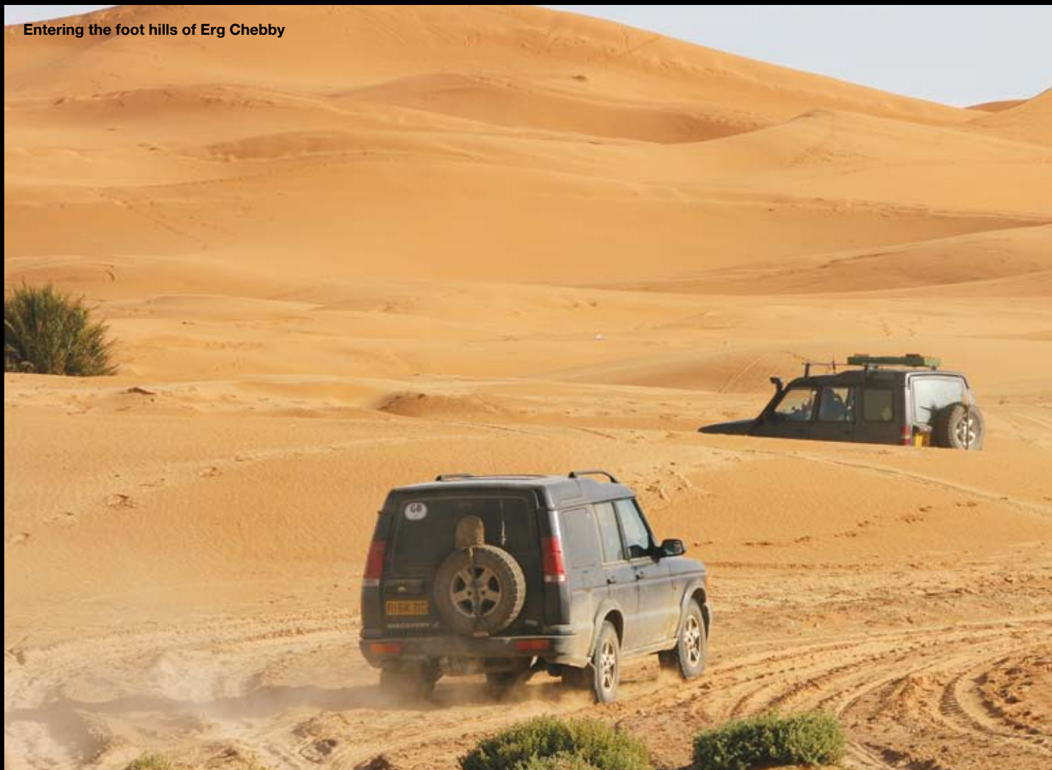
Entering the foot hills of Erg Chebby

and catch the early crossing to Ceuta. Filled with anticipation we boarded the new super cat car ferry that catapults you across the straits of Gibraltar.