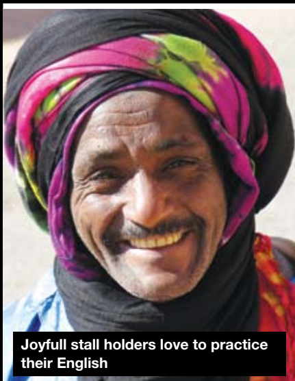
Joyfull stall holders love to practice their English