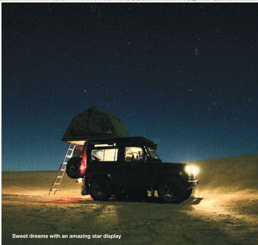
Sweet dreams with an amazing star display

For prices and availability visit www.worldsapartadventures.co.uk